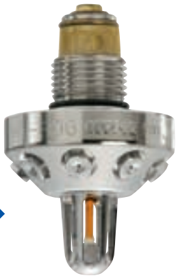
HI-FOG® 1000-series nozzle