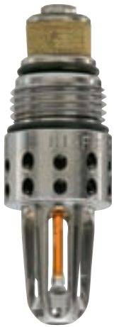
HI-FOG® 2000-series nozzle