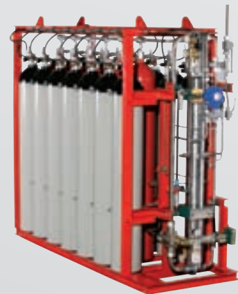
HI-FOG® gas-driven pump unit (GPU)