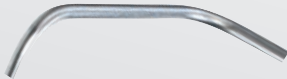
The small diameter, high quality stainless-steel HI-FOG® tubing bends easily around corners and obstructions.