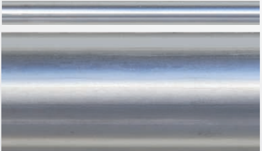
12mm and 60mm stainless steel tubes in actual sizes.