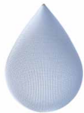
Typical size range of HI-FOG® micro-droplets 0.025 ... 0.2 mm