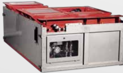
Gas-driven (GPU) pump unit for trains, undercarriage installation