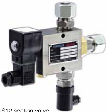
NS12 section valve