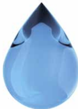
Typical size range of traditional sprinkler system drops 1 ... 5 mm