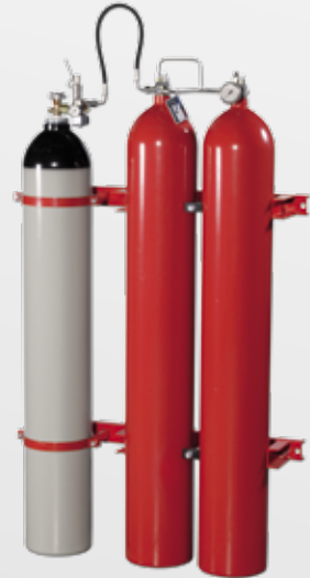
MAU 100 cylinder unit for trains