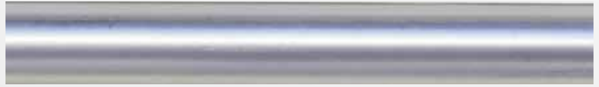
16 mm HI-FOG® tube, actual size