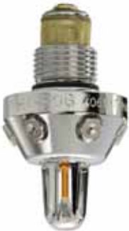
HI-FOG® 1000-series sprinkler head for train carriages