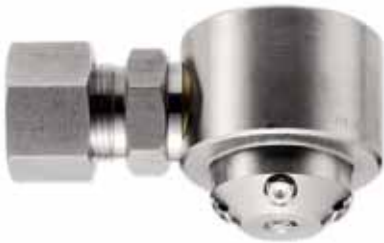
HI-FOG® spray head for train carriages